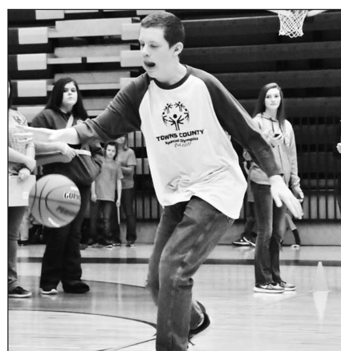
Special Olympics in full swing last Thursday at the UCHS gymnasium.